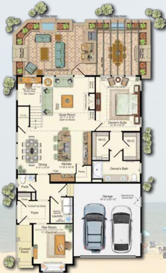
FIRST FLOOR Included Elevation A

*Floor plan dimensions are approximate. Floor plans have an extensive list of structural options for further personalization.