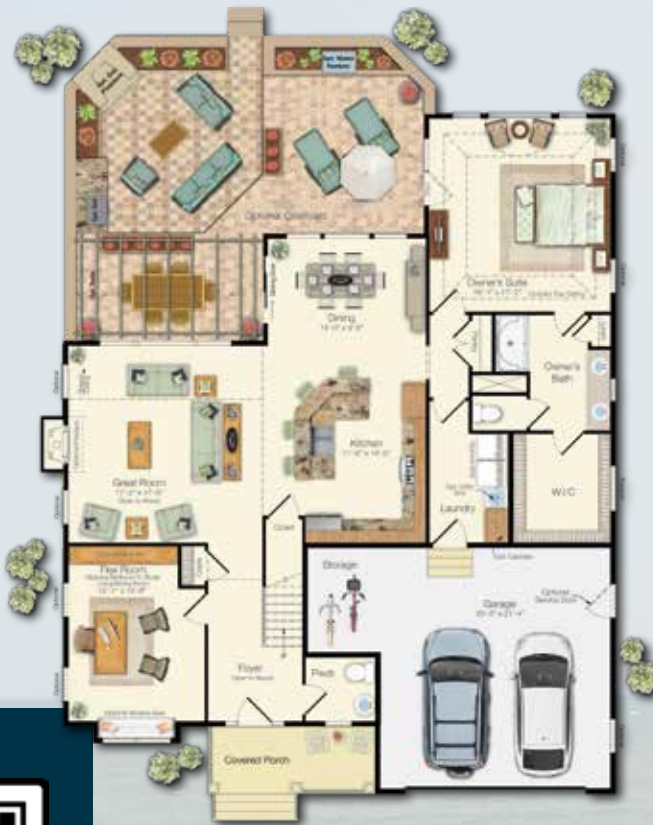
FIRST FLOOR Included Elevation A

*Floor plan dimensions are approximate. Floor plans have an extensive list of structural options for further personalization.