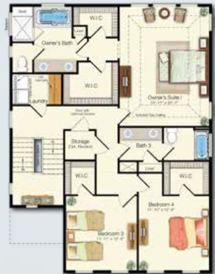
THIRD FLOOR Included Elevation A