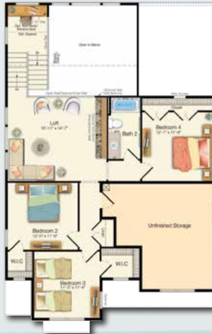
SECOND FLOOR Included Elevation A