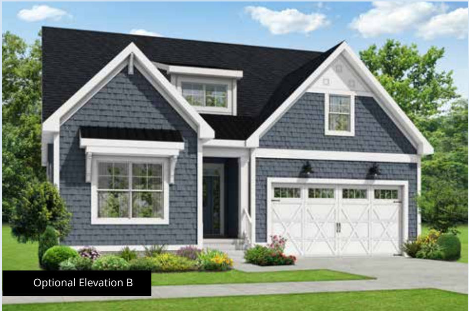
Optional Elevation B