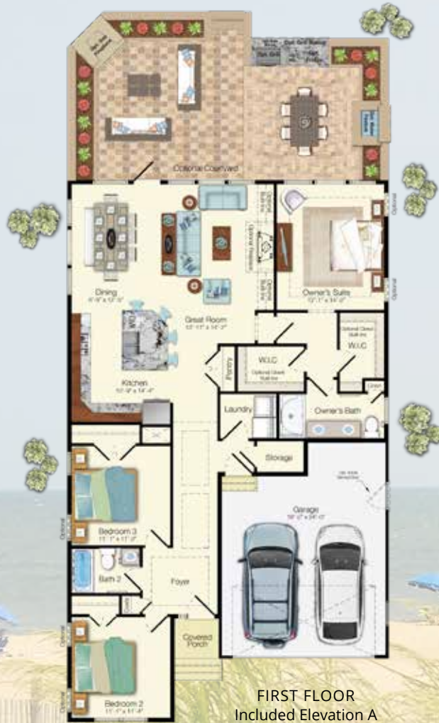
FIRST FLOOR Included Elevation A

*Floor plan dimensions are approximate. Floor plans have an extensive list of structural options for further personalization.