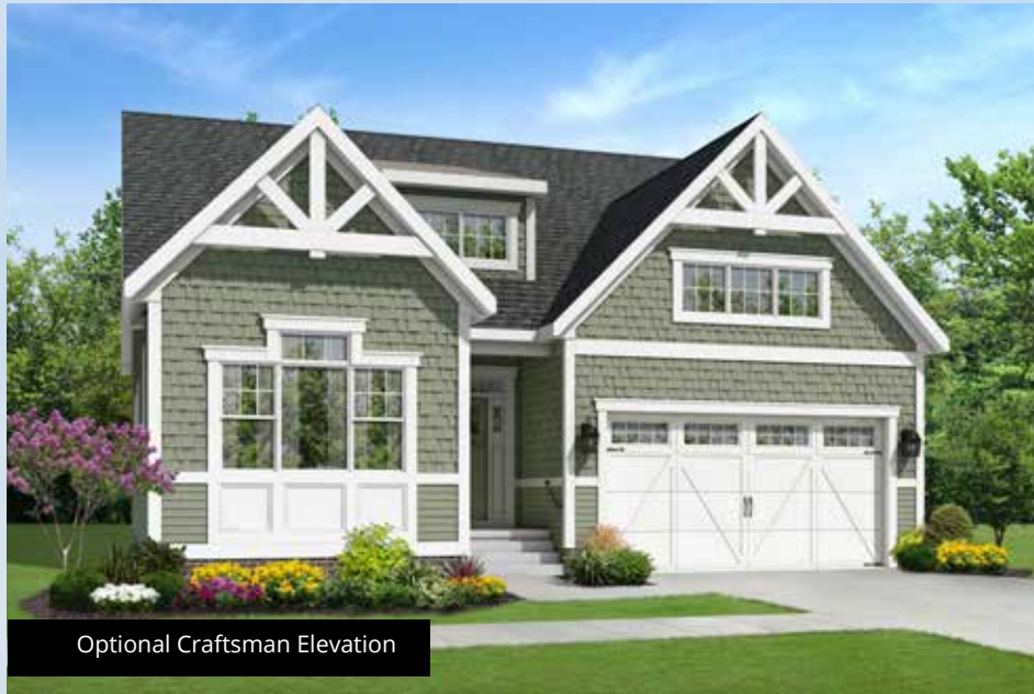
Optional Craftsman Elevation