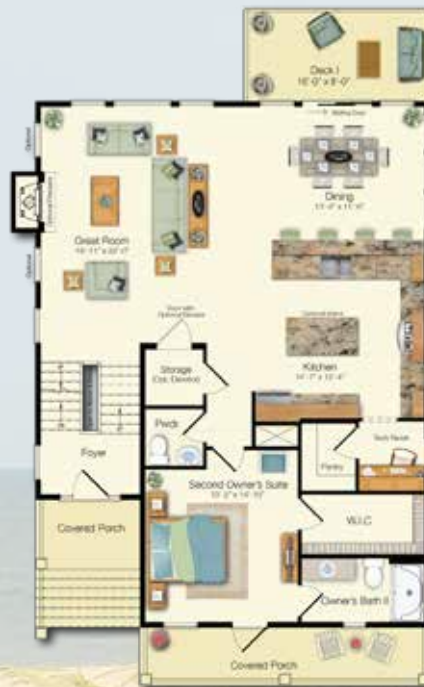
SECOND FLOOR Included Elevation A