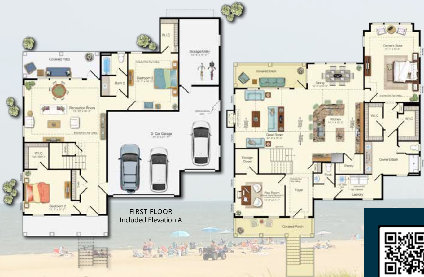
FIRST FLOOR Included Elevation A

*Floor plan dimensions are approximate. Floor plans have an extensive list of structural options for further personalization.