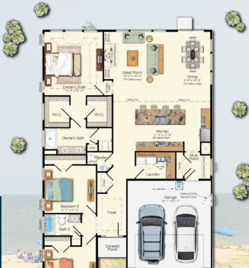
FIRST FLOOR Included Elevation A

*Floor plan dimensions are approximate. Floor plans have an extensive list of structural options for further personalization.