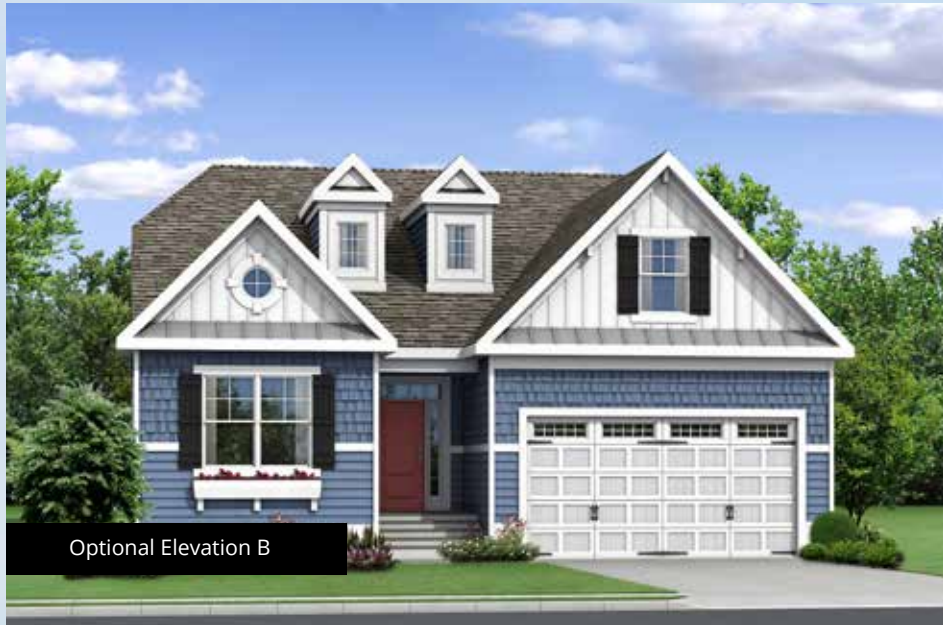
Optional Elevation B