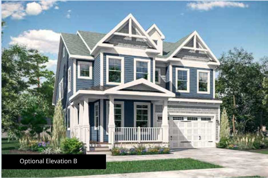
Optional Elevation B