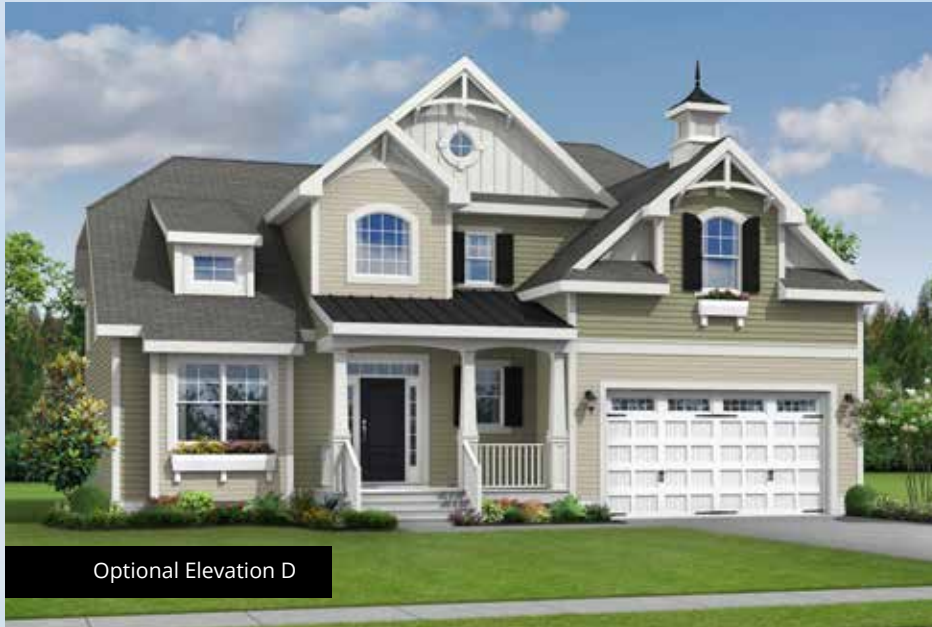
Optional Elevation D