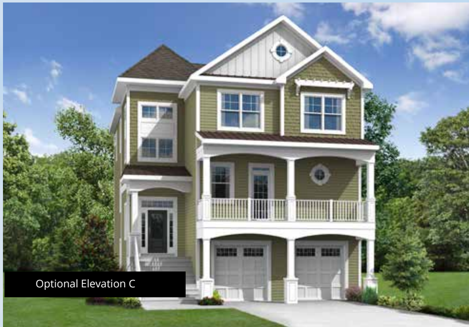
Optional Elevation C