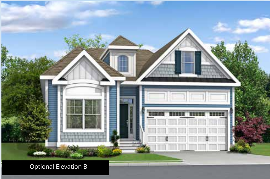
Optional Elevation B