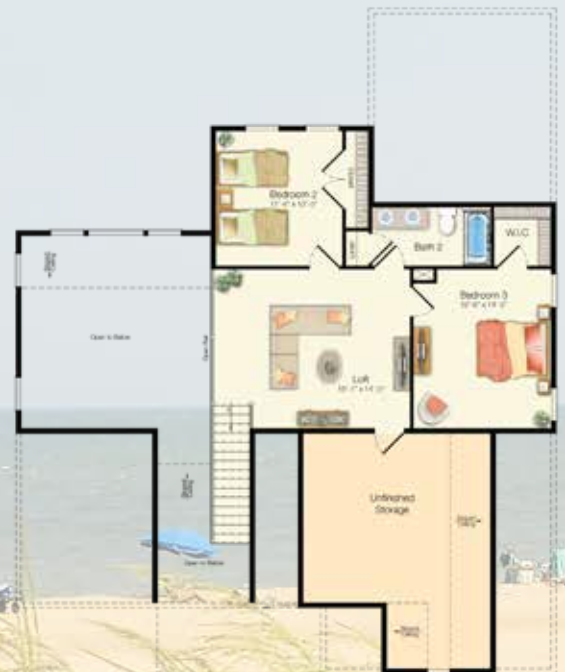
SECOND FLOOR Included Elevation A