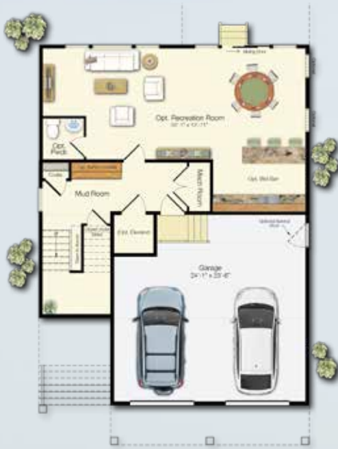
FIRST FLOOR Included Elevation A

*Floor plan dimensions are approximate. Floor plans have an extensive list of structural options for further personalization.