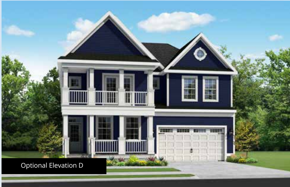
Optional Elevation D