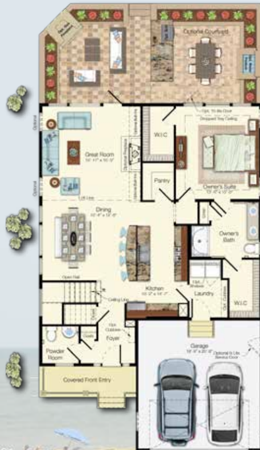
FIRST FLOOR Included Elevation A

*Floor plan dimensions are approximate. Floor plans have an extensive list of structural options for further personalization.