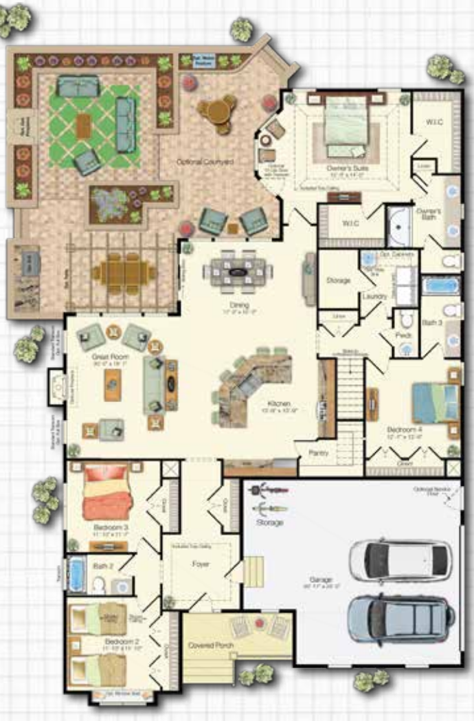
FIRST FLOOR Included Elevation A

*Floor plan dimensions are approximate. Floor plans have an extensive list of structural options for further personalization.