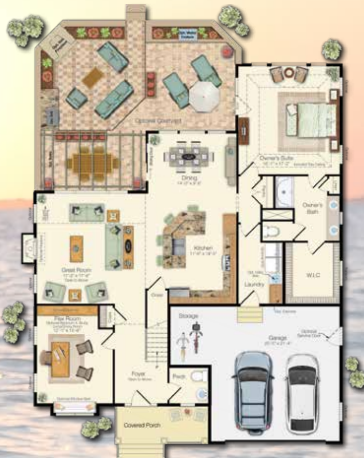
FIRST FLOOR Included Elevation A

*Floor plan dimensions are approximate. Floor plans have an extensive list of structural options for further personalization.