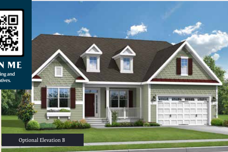
Optional Elevation B