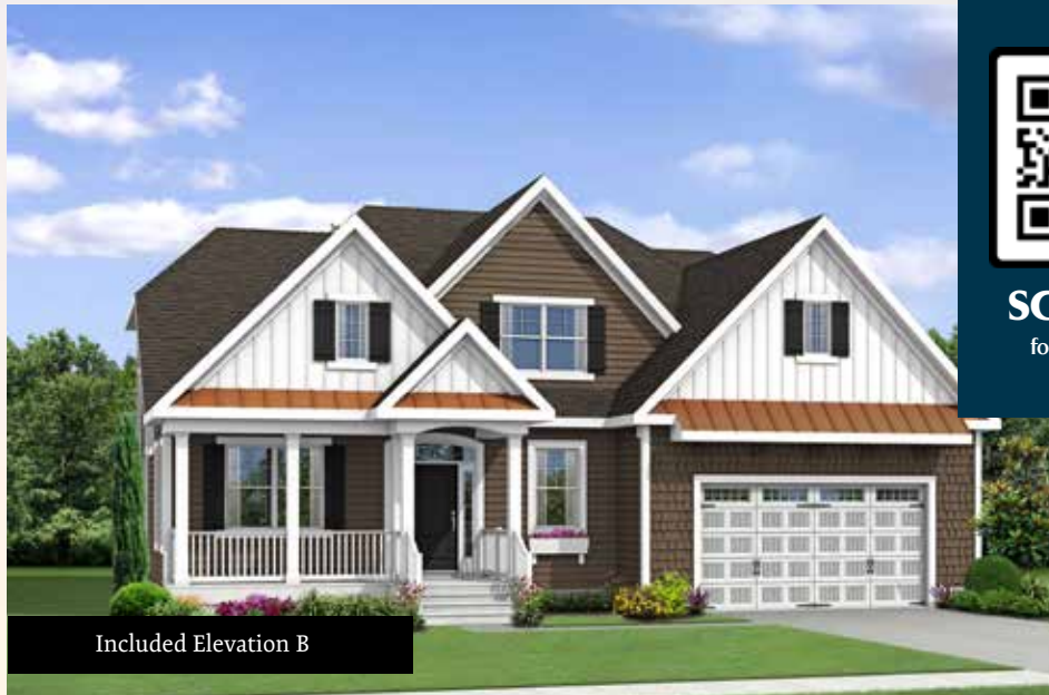
Included Elevation B