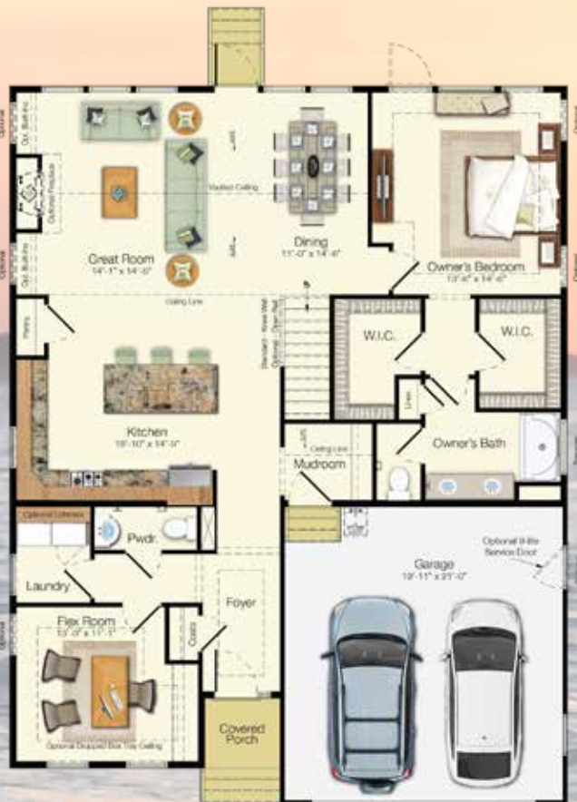
FIRST FLOOR Included Elevation A

* The City of Lewes has a building height restriction of 30.5'. Some floor plans cannot be built on certain lots based on street elevation and the height restriction. For more information on floor plans and lot availability, please contact our sales team.