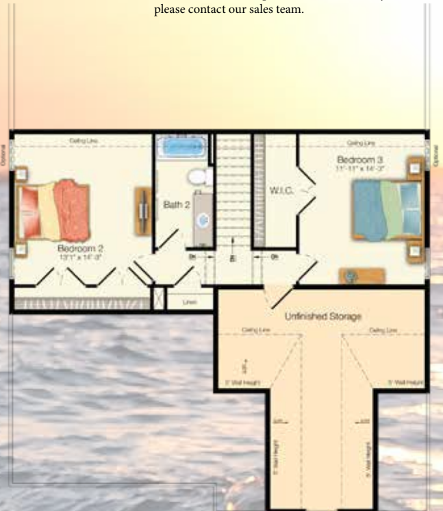
SECOND FLOOR Included Elevation A