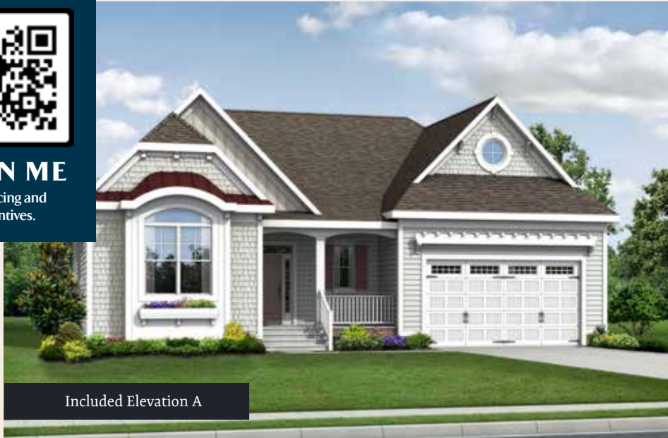
Included Elevation A