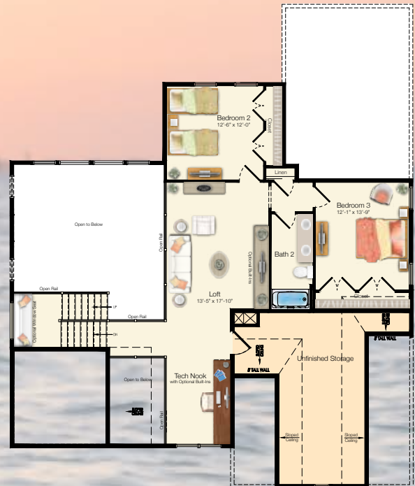
SECOND FLOOR Included Elevation A