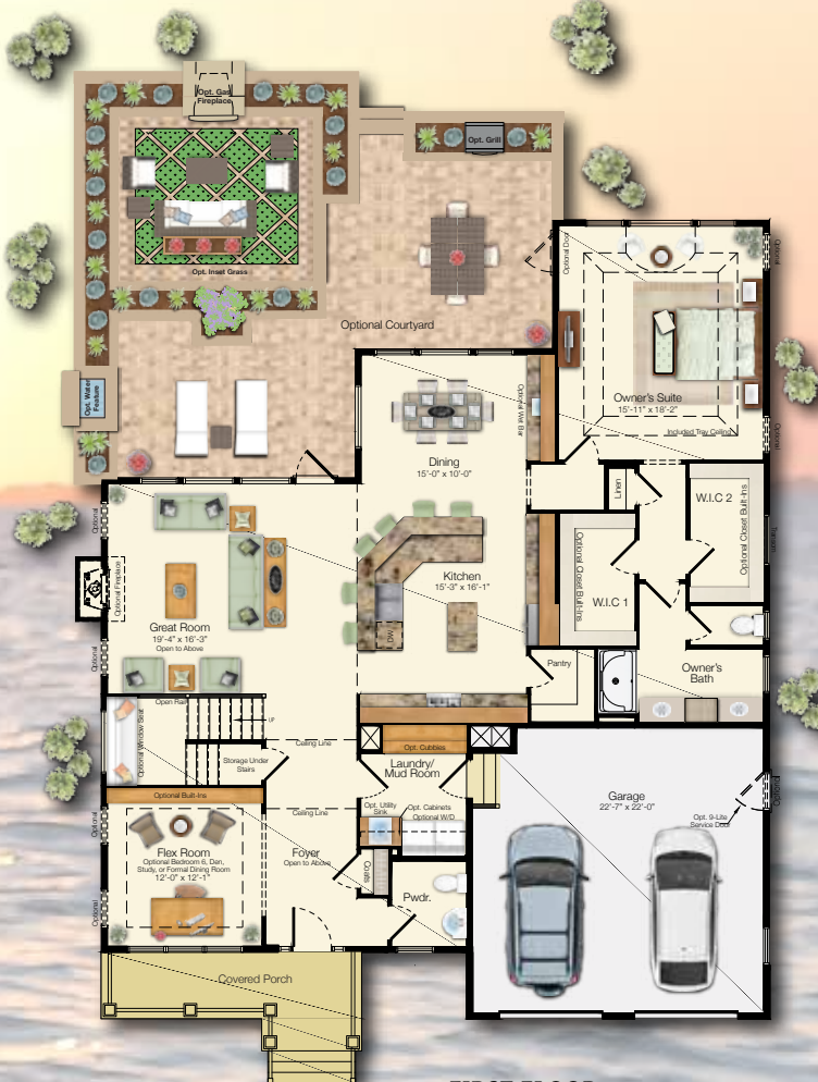
FIRST FLOOR Included Elevation A

* The City of Lewes has a building height restriction of 30.5'. Some floor plans cannot be built on certain lots based on street elevation and the height restriction. For more information on floor plans and lot availability, please contact our sales team.