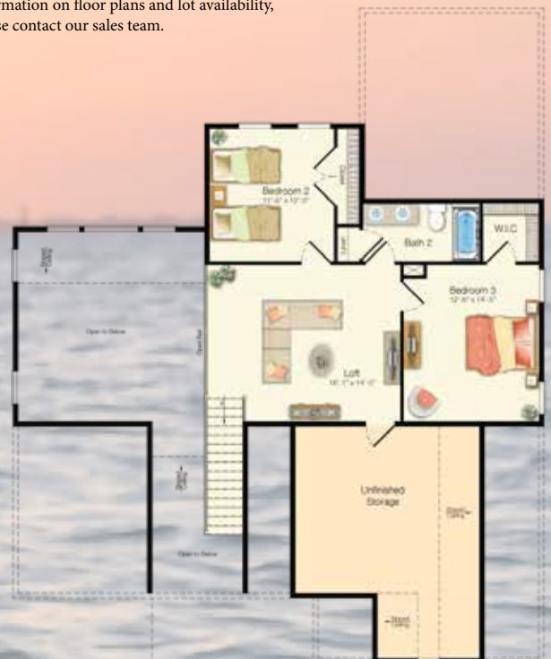
SECOND FLOOR Included Elevation A

* The City of Lewes has a building height restriction of 30.5'. Some floor plans cannot be built on certain lots based on street elevation and the height restriction. For more information on floor plans and lot availability, please contact our sales team.