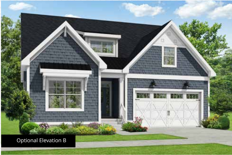
Optional Elevation B