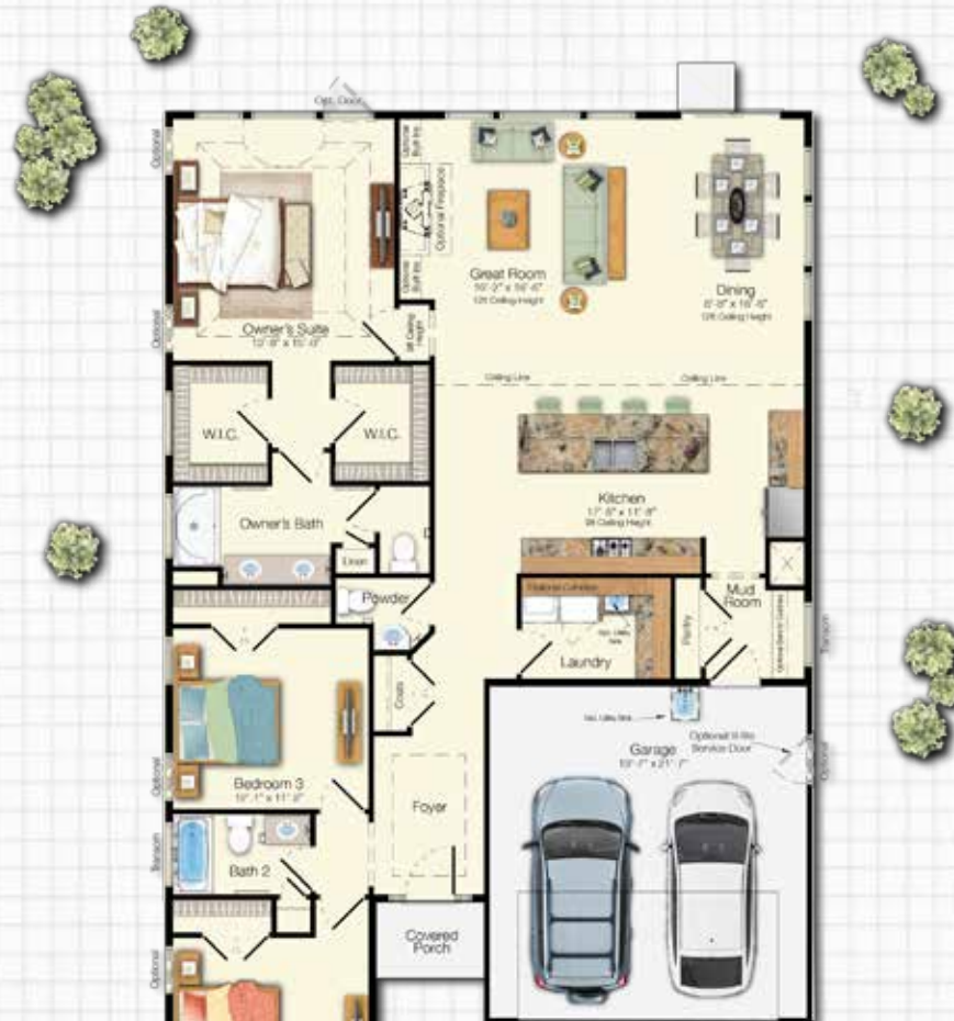
FIRST FLOOR Included Elevation A

*Floor plan dimensions are approximate. Floor plans have an extensive list of structural options for further personalization.