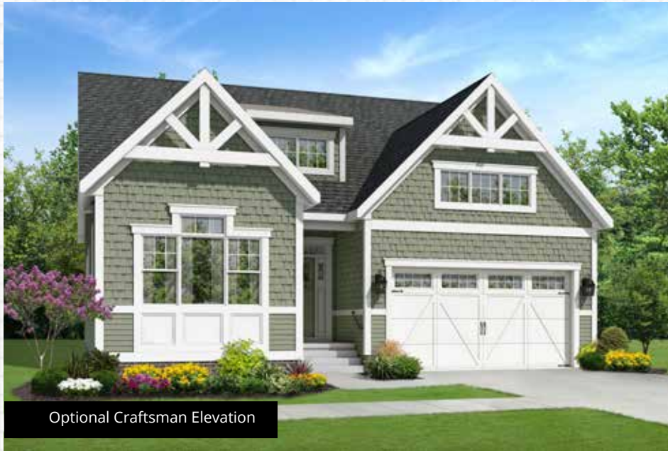
Optional Craftsman Elevation