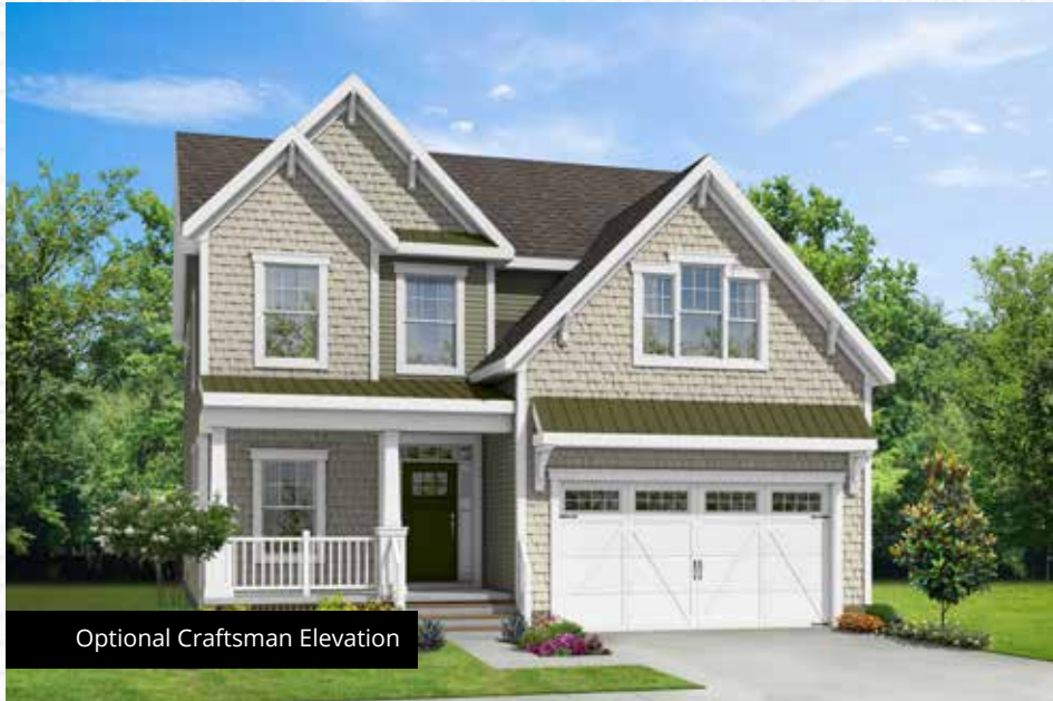
Optional Craftsman Elevation