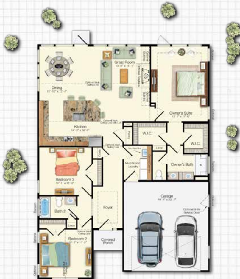
FIRST FLOOR Included Elevation A

*Floor plan dimensions are approximate. Floor plans have an extensive list of structural options for further personalization.