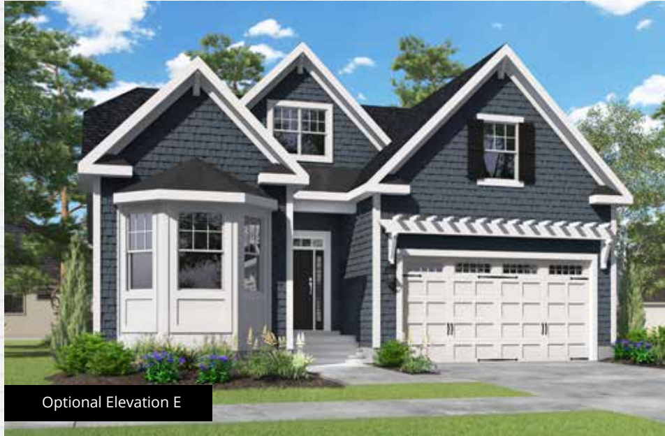
Optional Elevation E