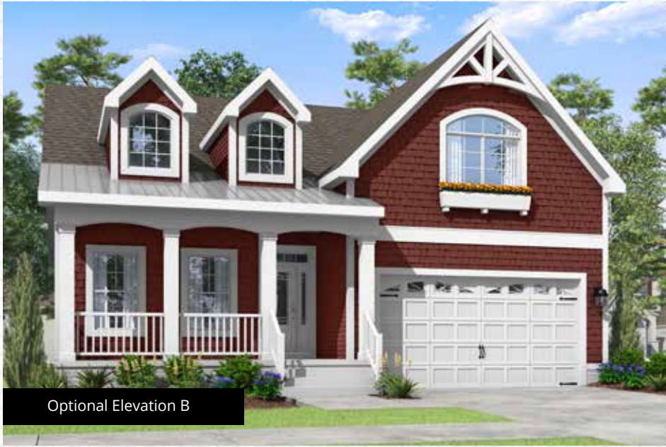
Optional Elevation B