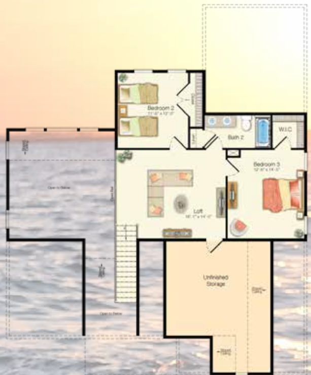
SECOND FLOOR Included Elevation A