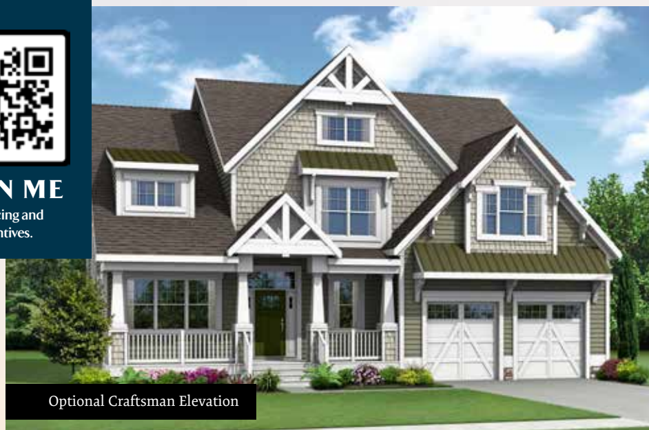
Optional Craftsman Elevation