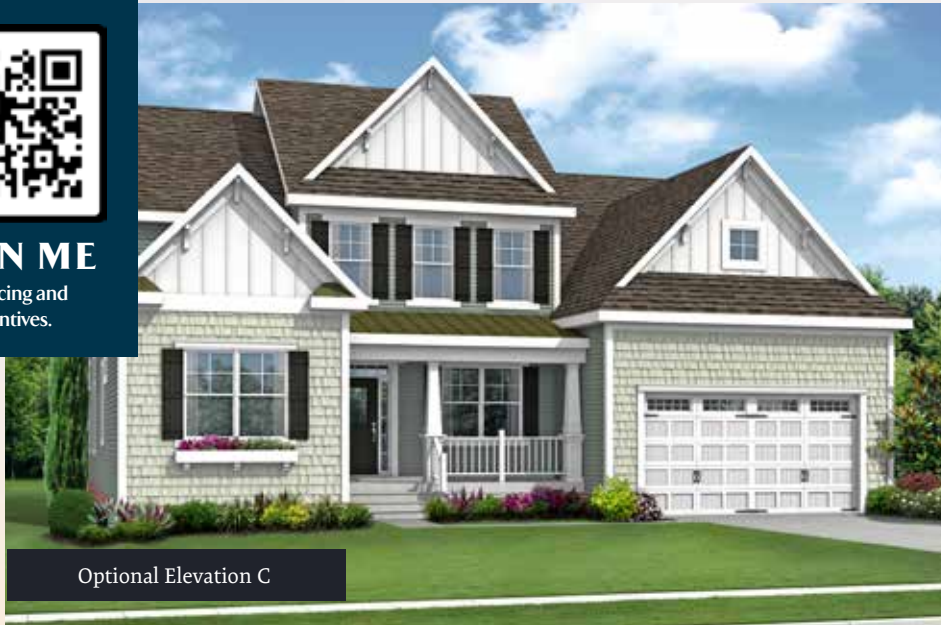
Optional Elevation C