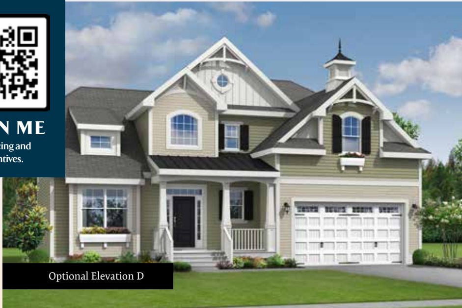
Optional Elevation D