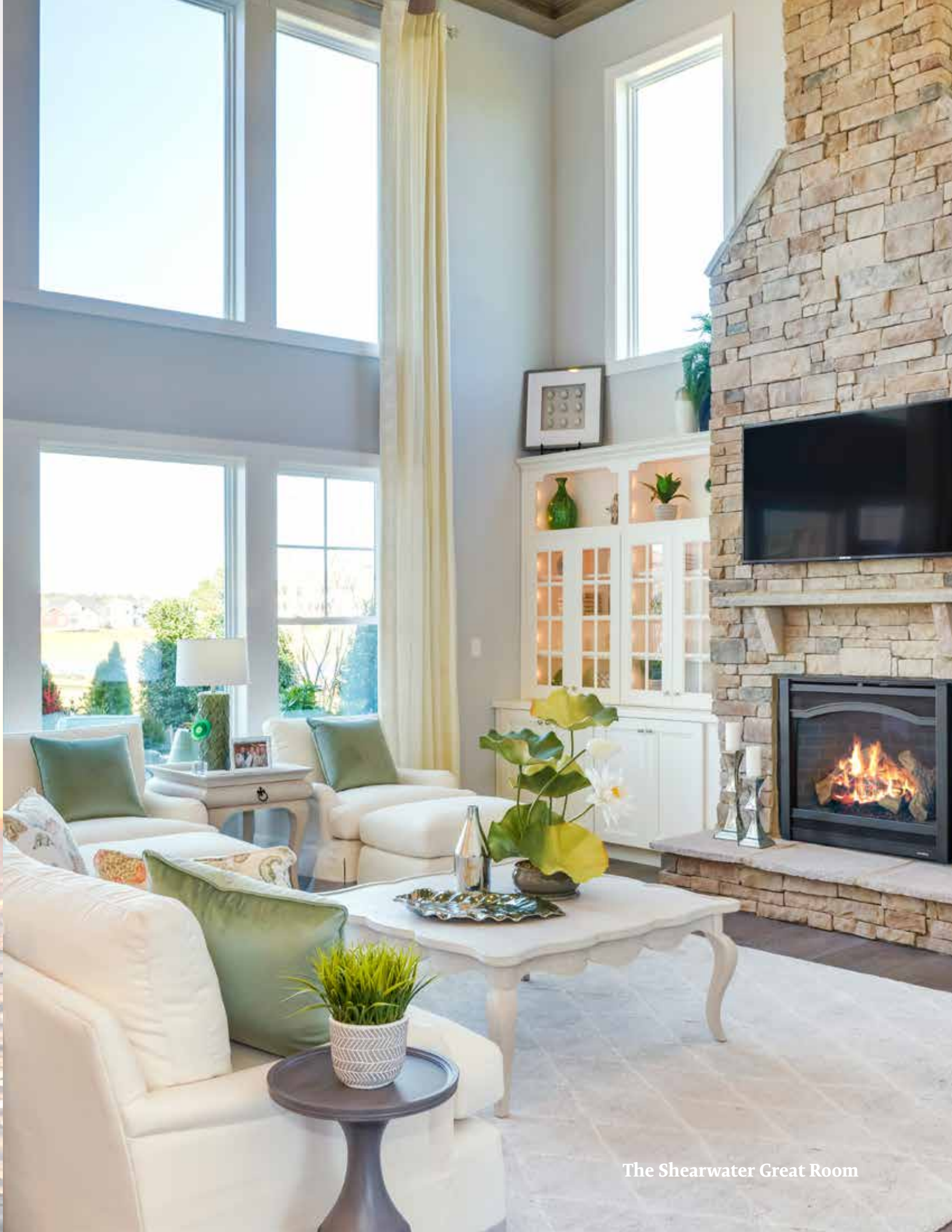
The Shearwater Great Room