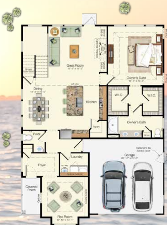
FIRST FLOOR Included Elevation A

*Floor plan dimensions are approximate. Floor plans have an extensive list of structural options for further personalization.