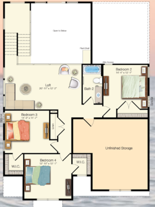
SECOND FLOOR Included Elevation A