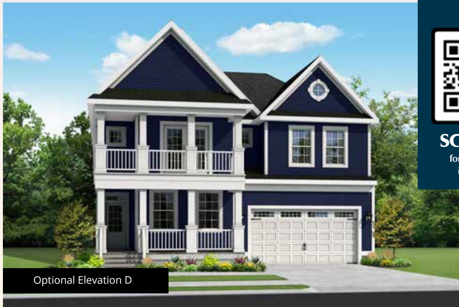
Optional Elevation D