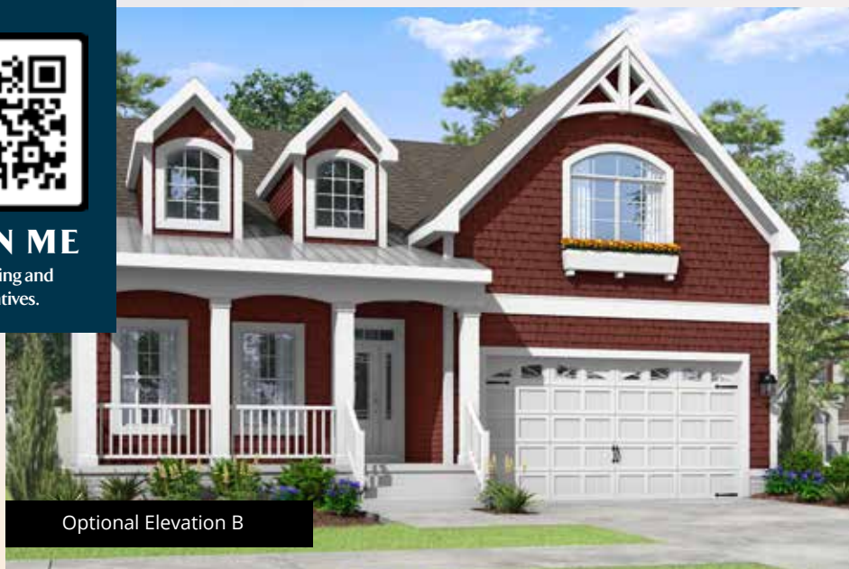
Optional Elevation B