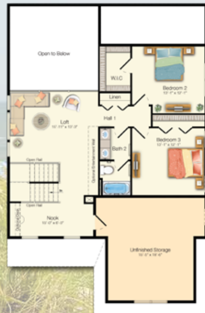
SECOND FLOOR Included Elevation A