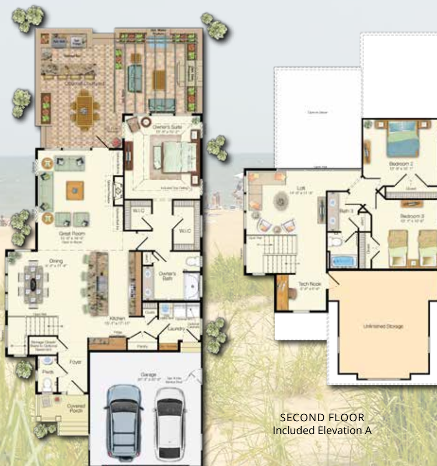
FIRST FLOOR Included Elevation A

*Floor plan dimensions are approximate. Floor plans have an extensive list of structural options for further personalization.