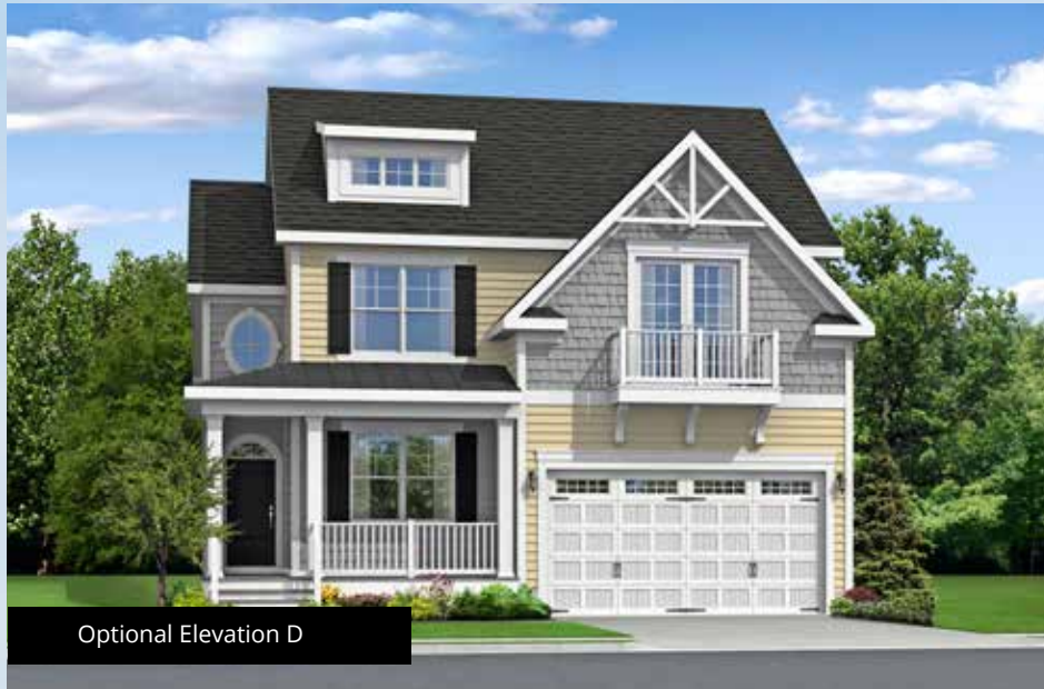
Optional Elevation D