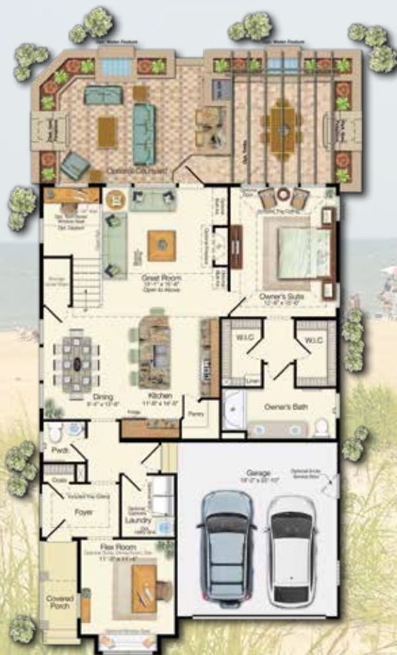
FIRST FLOOR Included Elevation A

*Floor plan dimensions are approximate. Floor plans have an extensive list of structural options for further personalization.