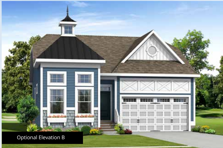
Optional Elevation B