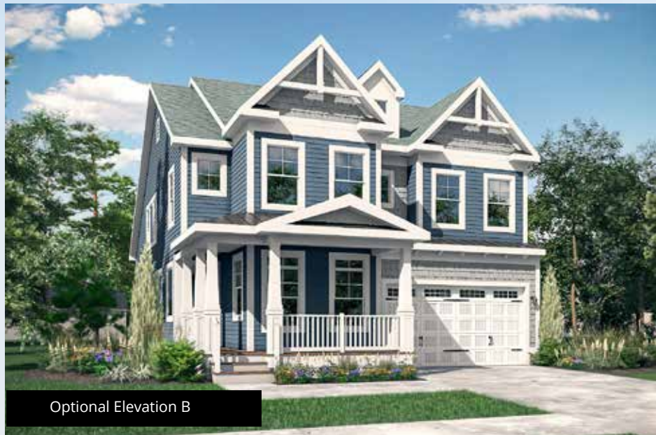
Optional Elevation B