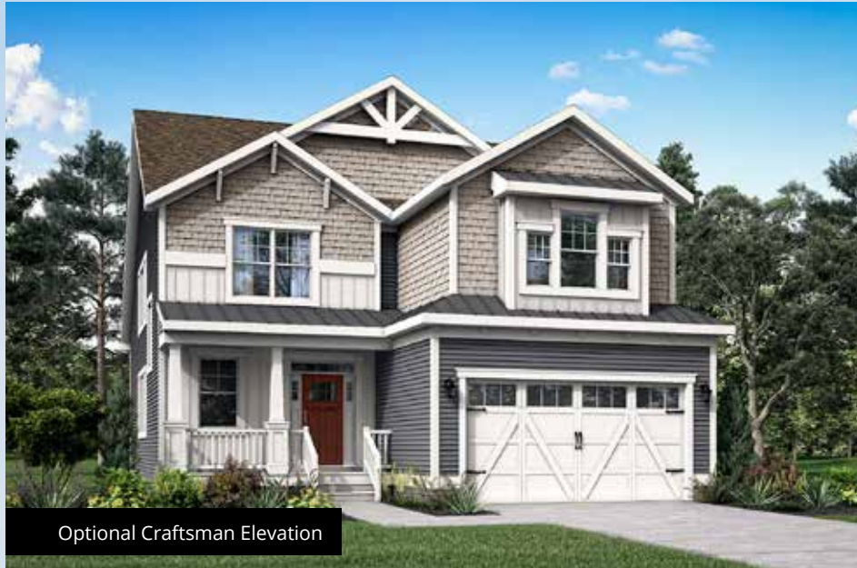
Optional Craftsman Elevation