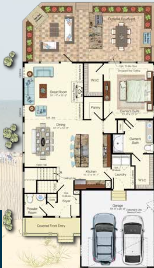
FIRST FLOOR Included Elevation A

*Floor plan dimensions are approximate. Floor plans have an extensive list of structural options for further personalization.