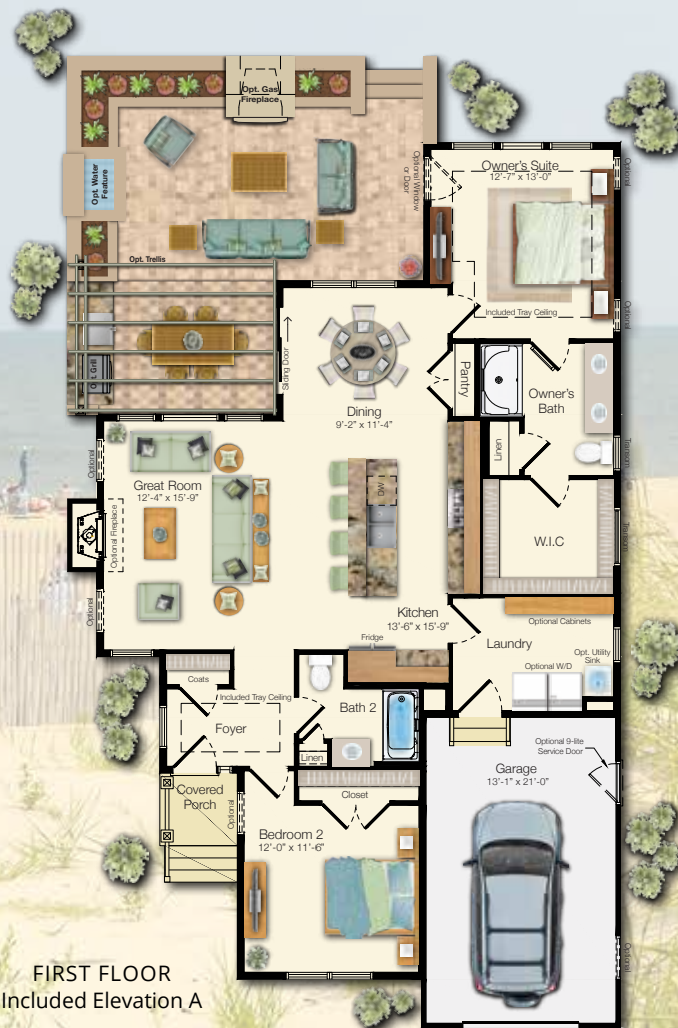
FIRST FLOOR Included Elevation A

*Floor plan dimensions are approximate. Floor plans have an extensive list of structural options for further personalization.