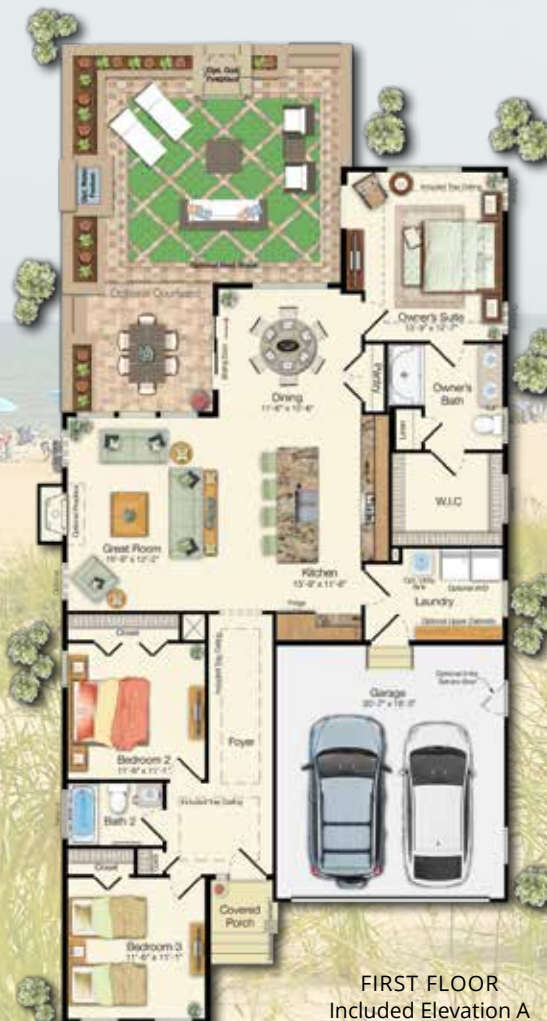
FIRST FLOOR Included Elevation A

*Floor plan dimensions are approximate. Floor plans have an extensive list of structural options for further personalization.