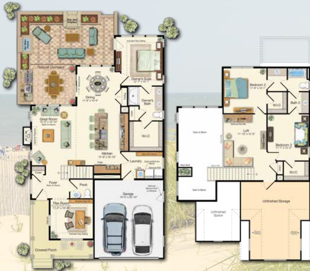
FIRST FLOOR Included Elevation A

*Floor plan dimensions are approximate. Floor plans have an extensive list of structural options for further personalization.