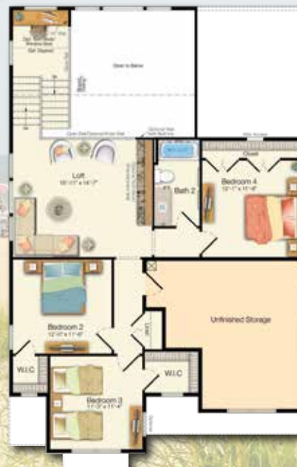
SECOND FLOOR Included Elevation A